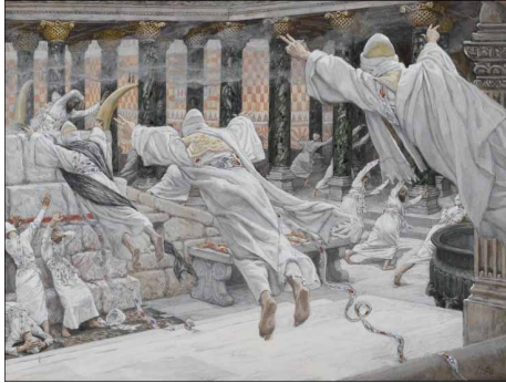
The Dead Appear in the Temple James Tissot Matthew 27:52-53