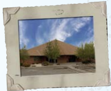
LOCKWOOD CAMPUS Sunday at 9:00 am & 11:00 am 1413 Rosebud Lane Billings, MT 59101