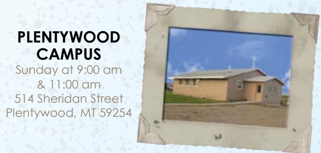
PLENTYWOOD CAMPUS Sunday at 9:00 am & 11:00 am 514 Sheridan Street Plentywood, MT 59254