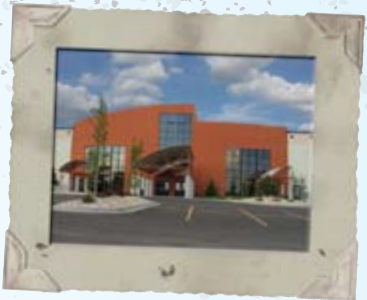
HEIGHTS CAMPUS Saturday at 4:00 pm & 6:00 pm Sunday at 9:00 am & 11:00 am 1235 W. Wicks Lane • Billings, MT 59105

I would like to become a member of Harvest Church. How do I do that? The first step to become a member is to attend our Membership Class which is offered three times per year. This class is held on a Saturday from 9:00 am to 2:00 pm and includes lunch. Stay tuned to The Harvest Weekly for more information.